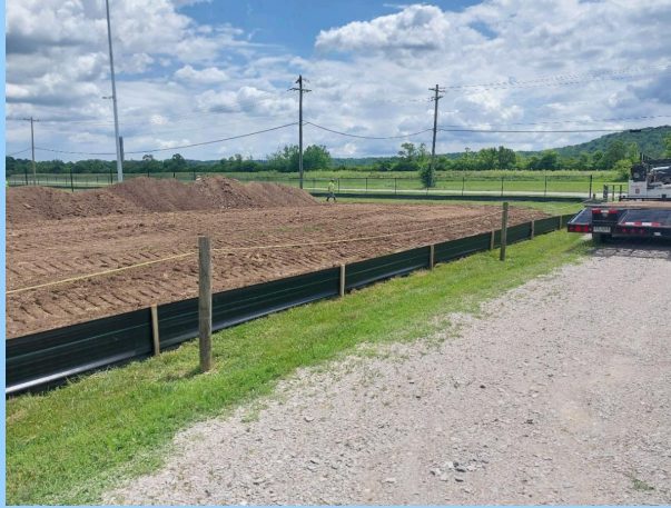
Silt fencing properly installed along the perimeter of a construction site.

The purpose of MCM4 is to ensure proper implementation of erosion, sediment, and other pollutant control measures during active construction projects to reduce pollutants in stormwater runoff. This MCM is overseen by Hamilton County Conservation District.